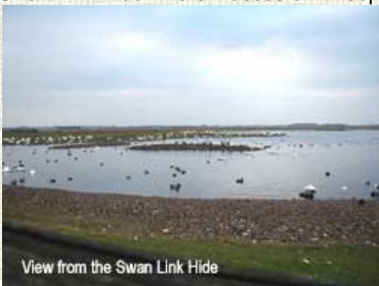
View from the Swan Link Hide

On arrival at Martin Mere we were astonished to find the car park overflowing. A crafts fair was being held in the main building and entrance fees had been waived for the day. Inside, despite the crowds, we were able to get seats by the viewing window. After a leisurely lunch, with some of our members buying hot soup in the restaurant, we walked to the Swan Link Hide where masses of Whooper Swans crowded the banks. As we scanned round the pool edges we picked up large numbers of Ruff. Using scopes we almost missed three Ruff which were amongst Greylags only a few feet in front of us. Though we searched all over we could not find any Bewick Swans. Though numbers here are usually low this was a little strange. Another birdwatcher then told us that there was only one here and he had not found it yet. As we walked towards the North West Water Hide we met a number of birdwatchers along the path looking for a Firecrest which had been last spotted only an hour earlier on an Ivy covered tree by the side of the path. We kept our eyes open and saw numbers of Siskin, Long Tailed Tits, and Goldfinches but no Firecrest. On reaching the North West Water Hide we found it completely empty and this was despite the masses of people at