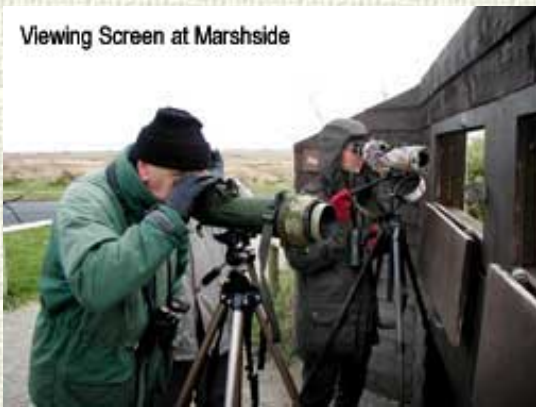
Viewing Screen at Marshside

numbers of Teal, Pintail, Shoveler and Mallard. Waders were represented by a large flock of Black Tailed Godwits but other waders were scarce and there was not a Golden Plover in sight. After 30 minutes at the viewing screen we decided that we had earned some warmth and moved to the Sandgrounders Hide. With no windows open it was warm and windless and after scopes were set up it was only a few minutes before our first bird of prey was spotted, a Merlin on the ground. Geese numbers were low, plenty of