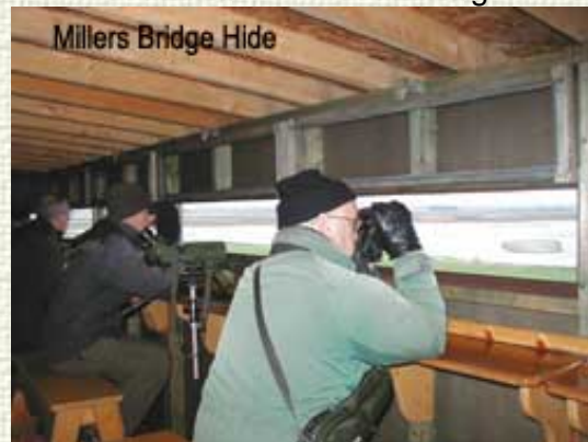
Millers Bridge Hide

04/12/02 The continuing spell of mild weather has prompted one or two species into song, especially the Thrushes. In Tatton both Song and Mistle have been tuning up and yesterday at the Anderton reserve we listened to the song of a visiting Redwing, not the full version, but the subtle sub-song often heard in the Spring just before they leave us for the north. Haydn's pool was quiet, just a couple of Dabchicks, small flocks of Mallard and Gadwall plus a flock of around 50 Teal, whilst in the surrounding trees and shrubbery we noted plenty of Thrushes and Siskins together with a small flock